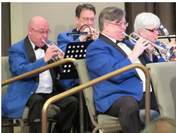
The cornet section in action.