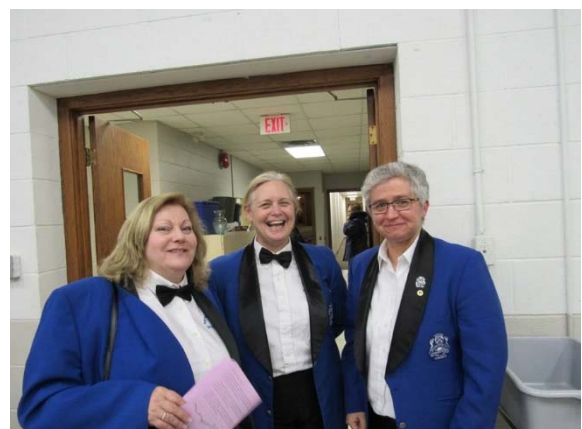
Enjoying post-concert refreshment.